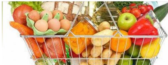
North Lancs Intercepted Food Club Alliance