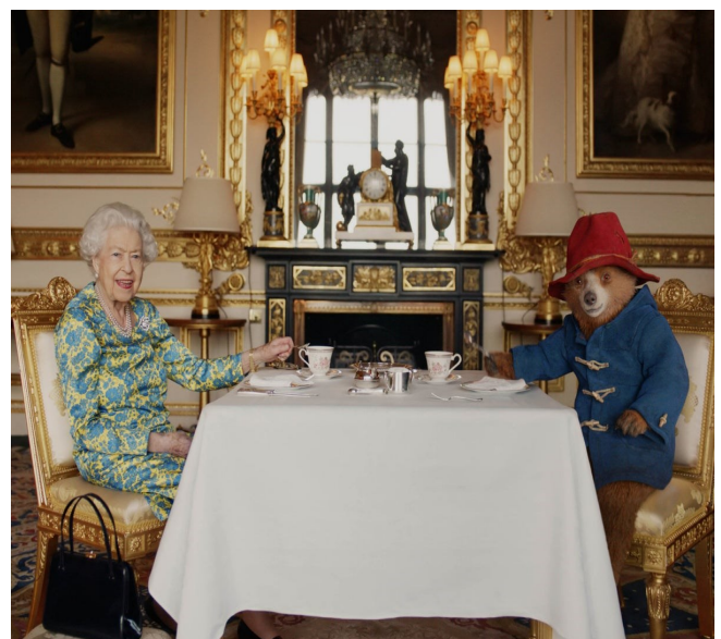
The queen and Paddington